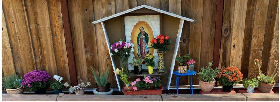
Top: Flowers brought by our Faith Formation families to Our Lady of Guadalupe.